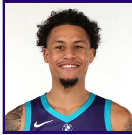
10 DJ Rodman