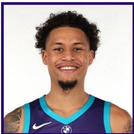
10 DJ Rodman